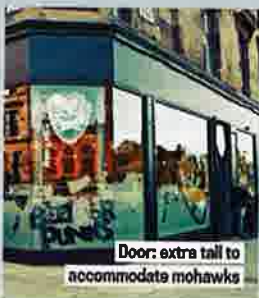
Door: extra tall to accommodate mohawks

1397 Argyle St, G3; brewdog.com The latest of BrewDog's beer bars stocks Slink The Bismarck! (at 41% ABV, sold in shots) alongside regular 77, Trashy Blonde and Punk IPA. Line them up with the meat and cheese platter (£12).