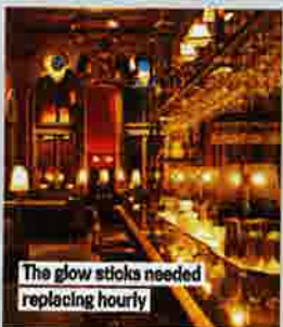
The glow sticks needed replacing hourly

Euston Rd, NW1; thegilbertscott.co.uk Located in the refurbished St Pancras Renaissance Hotel, The Gilbert Scott is a masterpiece of neo-gothic architecture. It also serves exceptional cocktails and great potted shrimp (£9.50).