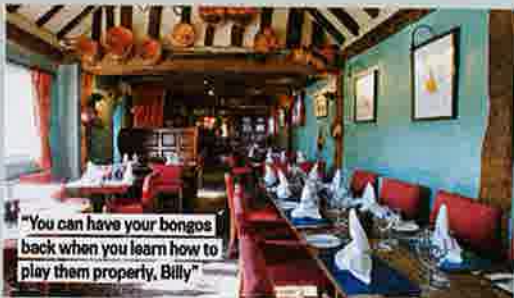
"You can have your bongos back when you learn how to play them properly, Billy"

A gastro tour of the UK's best eating and drinking establishments