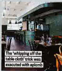
The 'whipping off the table cloth' trick was executed with aplomb

126 Devonshire Rd, W4; devonshirearmspub.com Islington's Drapers Arms team brings its British delicacies to west London. Prices are palatable too – smoked eel, bacon and quail egg is £6.50, with roasted duck breast just £13.50.